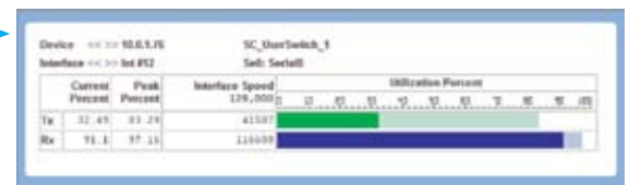
Real-time utilization of any link

Shows you what your Internet utilization is right now. No need to set up an analyzer—instantly know current congestion levels.