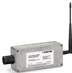
LongSpan Indoor/ Outdoor Radio (LS900A)