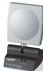
Pure Networking 802.11g High-Gain USB Wireless Adapter