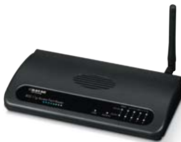
Pure Networking™ 802.11g Wireless Router