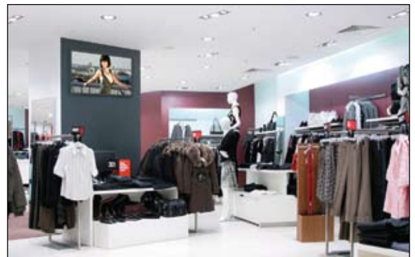
Stores can benefit from digital signage by using it for brand enhancement as well as selling ads on the network for products in the store.