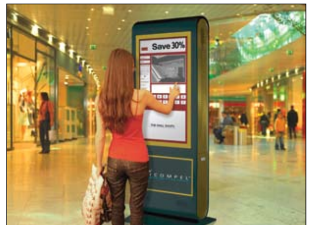
Digital signage can be used to get the attention of passersby, share information, and enhance the retail experience.

Hospitality: Hotel guests, especially business travelers, demand information to guide them in unfamiliar locales. Digital signage does wonders at delivering relevant and helpful information to guests in a hurry and even enables hotels to customize content for arriving groups or individuals. It's used to promote restaurant and bar offerings, sell profitable services (massage, concierge, dry cleaning, etc.), and publicize the location of meeting and fitness rooms and pool hours—thereby reducing the number of calls to the front desk. It also keeps guests informed of offerings outside the hotel, generating a separate stream of revenue through advertising for local restaurants, tour groups, limo and shuttle services, and local attractions, as well as paid content relating to trade shows.