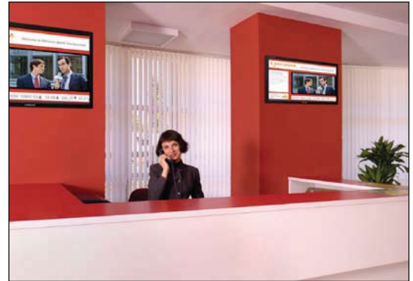
Digital signage can help communicate with employees, sharing information about upcoming programs, boosting morale, and recognizing achievements.

6. Public messaging: Keep the general public connected with the services they need, whether it's at wayfinding visitor centers, kiosks in town centers, or at bus terminals or subway stations. Also, under this model, digital signage can be used to broadcast critical, time-sensitive information, or even evacuation orders, by pushing impossible-to-ignore audio alerts and live video feeds to screens where people gather. Used in this fashion, digital signage is an invaluable communication tool for K-12 and higher-education environments, particularly on college campuses. Today's media-savvy youth respond well to a medium where the message is projected and amplified on a larger scale.