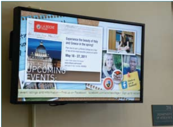
Signage at the entrance to the college athletic department.