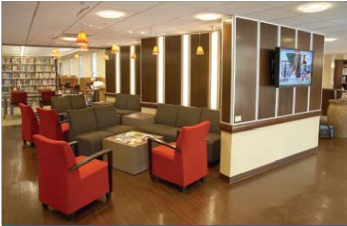
Eye-catching signage at the entrance of the college's John J. Wright Library, near the new Providence World Café.