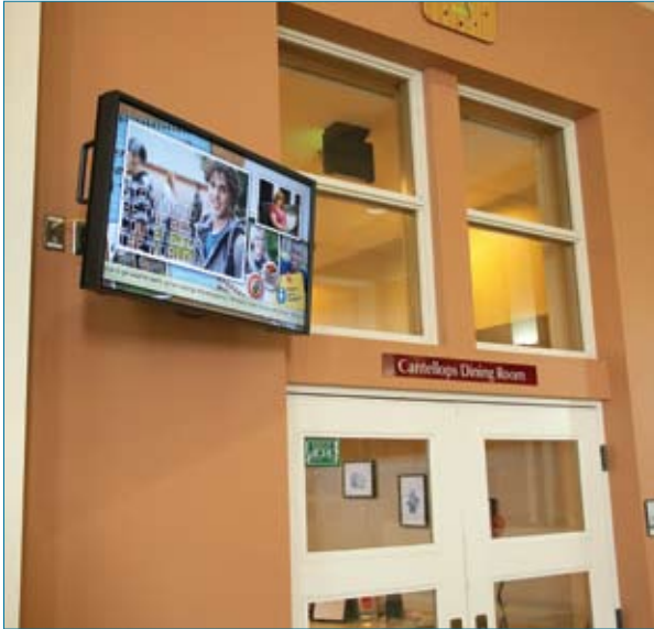
The digital sign installed outside the campus dining hall.