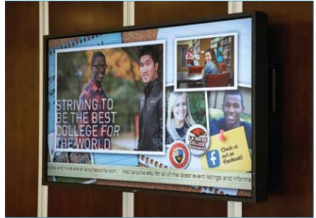
A closeup of the new iCOMPEL driven signage at the library entrance.