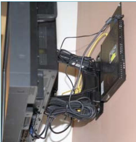
A small-form-factor iCOMPEL subscriber unit, shown mounted on the wall behind the NEC screen near the entrance to the campus dining hall, receives multimedia content via a network connection from an iCOMPEL publisher unit in a central data closet.