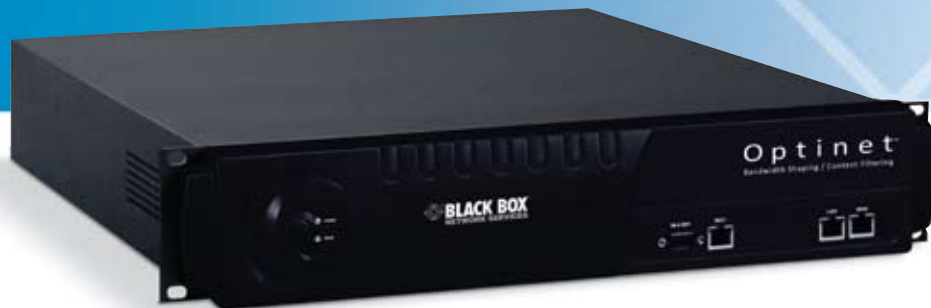
This deep-packet, layer 7 inspection device (FE408020XA) optimizes Internet use for your organization.

Optinet from Black Box scans, identifies, and controls Internet traffic, and provides advanced content filtering, reporting, application prioritization, bandwidth management, and threat protection.