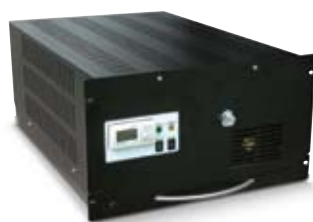
Cold Front Coolant Management Systems