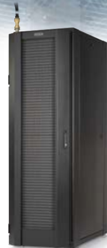
Cold Front Heat-Transfer Door