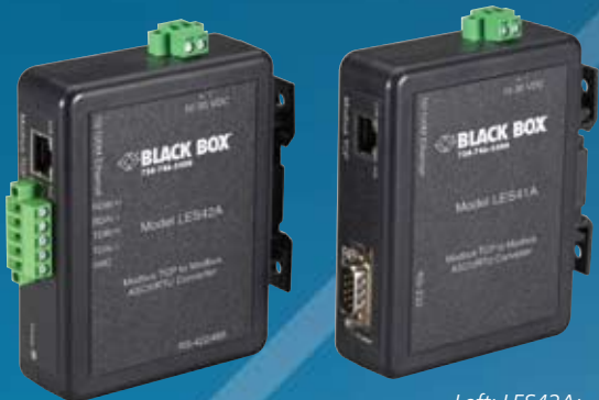
Left: LES42A; right: LES41A