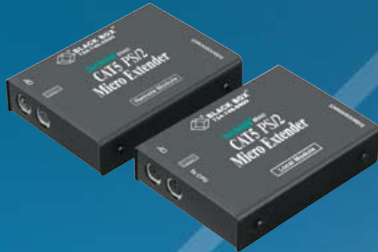
ACU1007A: left: remote module; bottom: local module