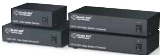
Top: AC502A-R2; bottom: AC503A-R2

AC503A-R2: 1.6"H x 6.3"W x 5"D (4.1 x 16 x 12.7 cm)