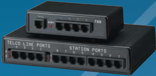
Top: 40423; bottom: 40426

Compliance — EMI/RFI: FCC Part 15 Subpart B Class A, IC Class/classe A; Phone-system compatibility: FCC Part 68 (registration number 4E1USA-21459-KX-N) Ringer-Equivalence Number — 0.2 B Line Type — 2-wire dialup Maximum Distance — 40423–40424: 150 ft. (45.7 m) from Manager to analog phone device User Controls — 40426: (1) Rear-mounted 4-position ring enable/disable DIP switch for telco/subscriber ports 1 through 4; 40429: (1) Rear-mounted 4-position ring enable/disable DIP switch for telco/subscriber ports 1 and 2 (DIP-switch positions 3 and 4 are unused); (7) Internal jumpers for temporary S Module conversion MTBF — 86,000 hours Interface — Modular telco (PSTN) Connectors — For power: (1) Rear-mounted 2.1-mm jack; To line: 40423–40424: (1) Front-mounted RJ-11 (4-pin) female; 40425: (2) Rear-mounted RJ-11 (4-pin) female; 40426: (4) Front-mounted RJ-12 (6-pin) female; 40427–40428: None; 40429: (2) Front-mounted RJ-12 (6-pin) female; To devices: All RJ-12 (6-pin) female: 40423: (4) front-mounted; 40424: (4) front-mounted, (4) rear-mounted; 40425–40429: (8) front-mounted; For expansion (40427–40429 only): (1) Rear-mounted DB25 female; Additional connectors used to link base units together: 40425–40426: (1) DB25 female