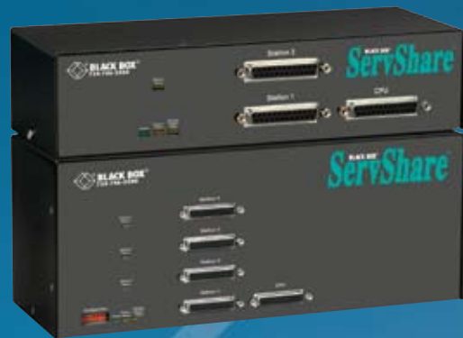
Top: KV752A; bottom: KV754A