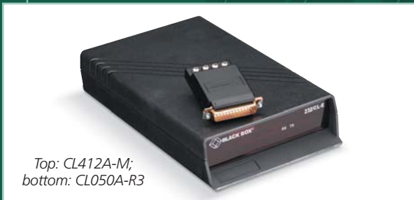
Top: CL412A-M; bottom: CL050A-R3